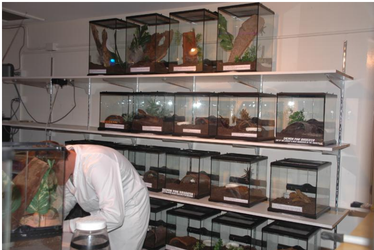
View of the back wall holding area. Arboreal tanks at top.

Ideally the main tarantula room- which by law will be the exhibit and the holding room in one- will have a large window space for the public to view. Tarantulaville has four dedicated viewing windows with 1 or 2 tarantulas displayed in each one as well as a larger window giving view to the whole room. Specimens off display are housed individually on shelving opposite the main window and are visible to the public. The shape and size of the room will depend on the space, existing buildings and money available but should maximise the visibility of the subjects to the public.