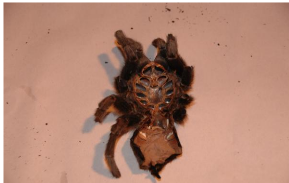
Brazilian Black ( P.pulchra ) moult.

Considering we aren't allowed to breed exotic tarantulas in Australia, moulting is probably the biggest event in our tarantulas' captive life. Juvenile specimens will moult about every three months while mature adult females every year to two years (pers. obs.). Some signs that a moult is on its way are fasting (as mentioned in the Feeding chapter) and a tendency to seek moisture. As the moult approaches hairs may be shed from the abdomen and the skin beneath will noticeably darken, this is called premoult. On the big day the tarantula will roll onto it's back and begin separating from its old exoskeleton, this process can take up to 24 hours (a dead spider will remain upright with its legs tucked underneath) (pers. obs.)