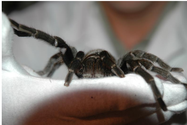
Crickets eye view ( Phrixotrichus pulchra )

Tarantulas are opportunistic ambush predators, relying heavily on their hairy legs to relay vibrations to their brains, for this reason live food is essential (Brunet 1994). In captivity tarantulas will thrive on a diet of insects alone and as they are readily available and easy to breed the humble house cricket ( Acheta domestica ) will be the main fare. At the ARP we use crickets about 90% of the time, which are readily accepted due to their movement. The remainder of food items would be cockroaches, mealworms and, extremely rarely, pink mice. The only other public facility with tarantulas in Australia (the Victorian Museum) also uses this diet. Little is known of tarantulas' exact dietary needs, so whether this relatively unvaried diet is detrimental needs to be ascertained.